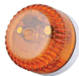
Solex Amber - White Base