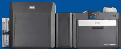
Dual-sided printer/encoder with optional lamination