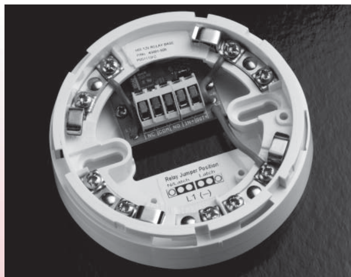
Part no: 45681-508

The moulding has an aperture to accept the locking grub screw built into the detector case.